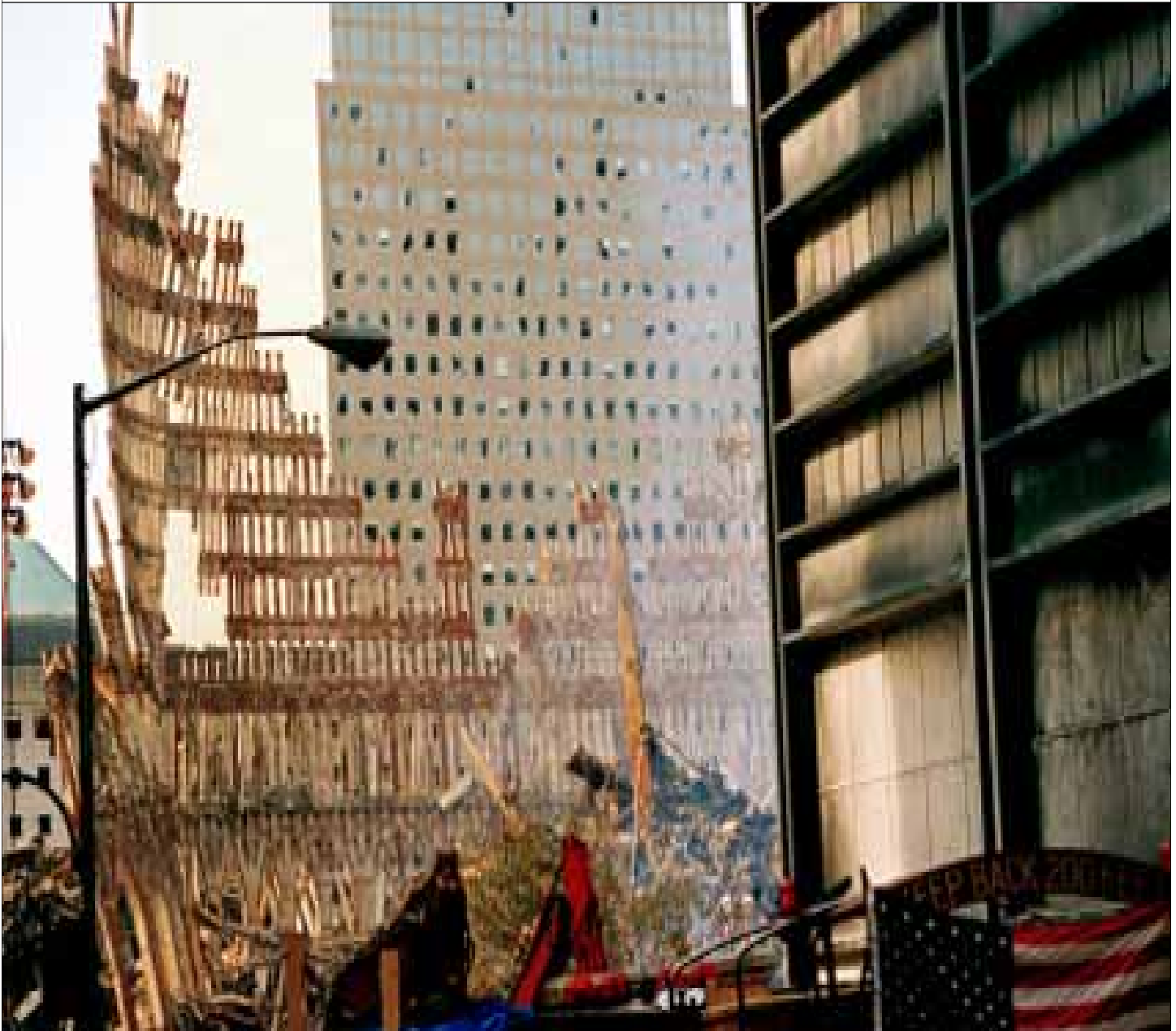
Patriot Day is held in memory of nearly 3000 people who died during terrorist attacks in New York, Washington DC, and Shanksville, Pennsylvania on September 11, 2001.

For more information please call the lodge at (509) 525-2901