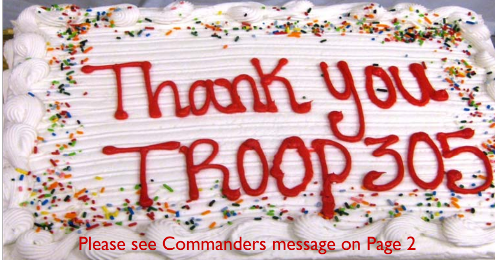
Please see Commanders message on Page 2