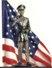
Statue Dedication 1996 Walla Walla WA