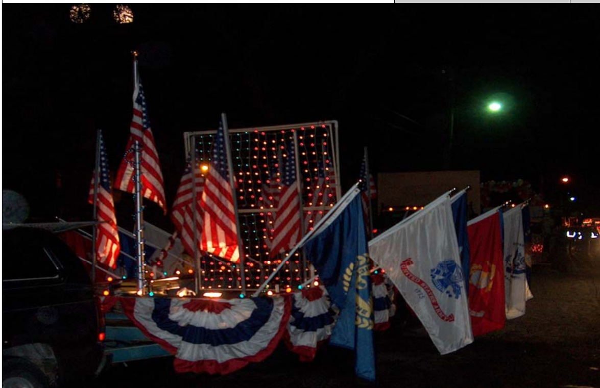
AMVETS Post Eleven-Eleven's entry in Macy's Light Parade held in Downtown Walla Walla on December 4th

NATIONAL HEADQUARTERS 4647 Forbes Boulevard Lanham, Maryland 20706-4380 TELEPHONE: 301-459-9600 FAX: 301-459-7924 E-MAIL: amvets@amvets.org