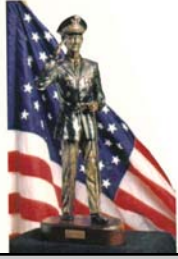
Statue Dedication 1996