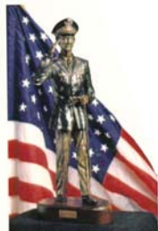
Statue Dedication 1996