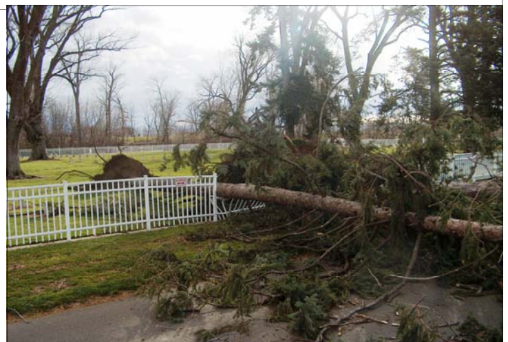
The fence built by AMVETS Post #1111 at Fort Walla Walla Cemetery, suffered some damage also.