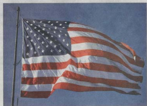
Top: Jerry Cummins (right) rolls up Old Glory with the help of other volunteers as the old American flag is replaced Monday. Above: After some unsuccessful attempts to raise the new flag, it unfurls moments after it reaches the top of the flagpole