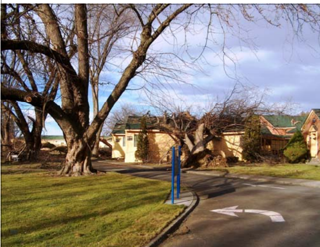
The Wainwright Medical Center was hit hard by the January 4th wind storm that had recorded gusts up to 78 mph.

The flag poles have been ordered and several generous contributors have already given for a total of almost