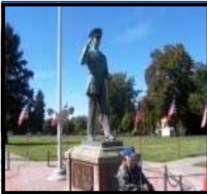
Statue Dedication 1996