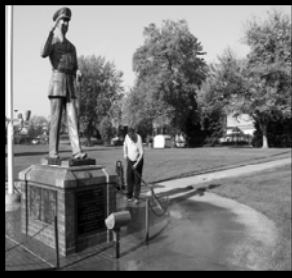
Statue Dedication 1996